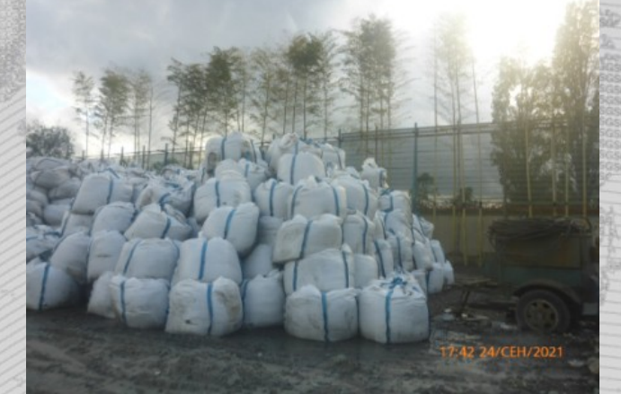
Photograph No.15 Chuquicamata IM21-CHU01